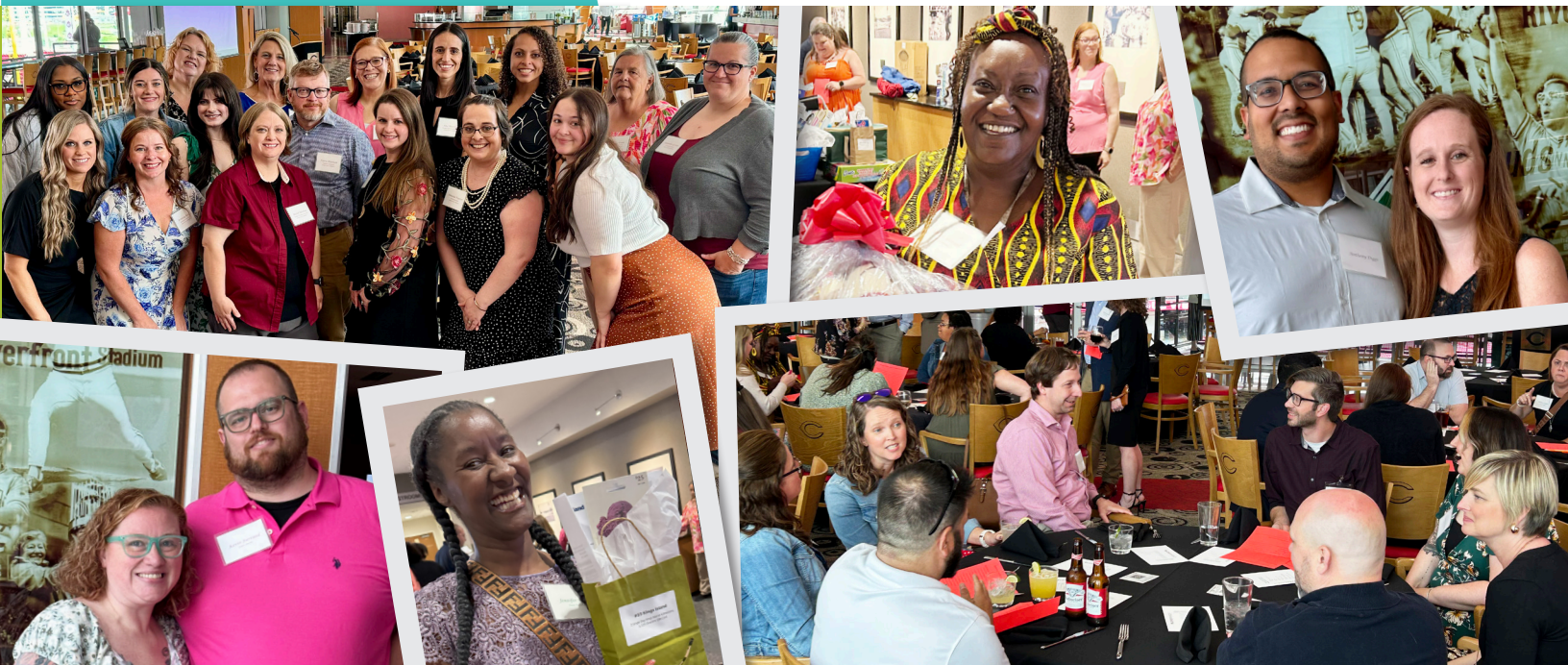
2024 Foster Parent Appreciation Dinner